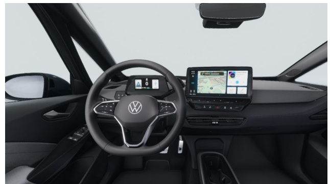
Standard on ID.3 Pro S Dusty Grey Dark stitching Crystalgrey

Note: Some parts of leather interior trim will contain artificial leather Note: The print processes do not allow exact reproduction of the upholstery & insert colours.