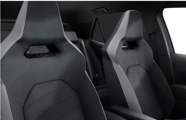
Artvelour Seats - Top sports seats Soul-Artvelour eco Option on ID.3 Pro & Pro S with Interior Plus Package