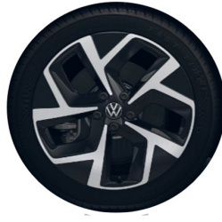
STANDARD ON ID.3 PRO S 19" 'Wellington' alloy wheels 7.5J x 19 Tyres: 215/50 R19