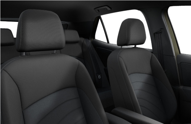
"Taia" Fabric seats Grey-Melange Taia/Soul Black Standard on ID.3 Pro