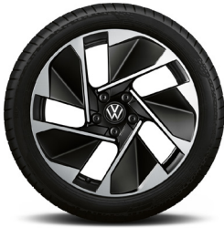
STANDARD ON ID.3 Pro Plus 18" 'East Derry' alloy wheels 7.5J x 18 Tyres: 215/55 R18