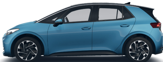
Costa Azul Metallic** 3KA1