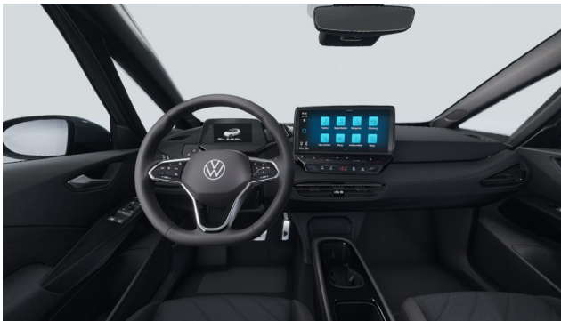
Standard on ID.3 Pro Soul stitching Crystalgrey