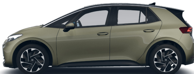
Dark Olivine Green Metallic** H0A1