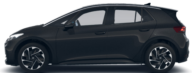
Mythos Black Metallic** 0EA1