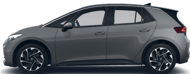
Moonstone Grey Solid C2A1