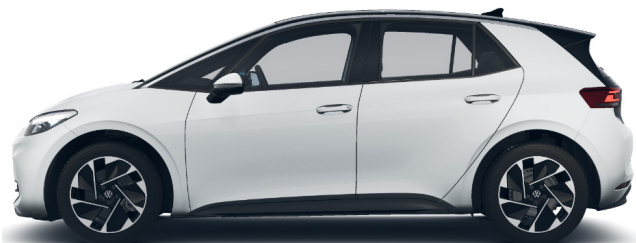
Glacier White Metallic** 2YA1