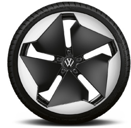
STANDARD ON ID.3 Pro S Plus 20" 'Sanya' alloy wheels 7.5J x 20 Tyres: 215/45 R20