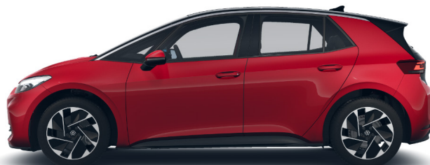
King's Red Metallic** P8A1