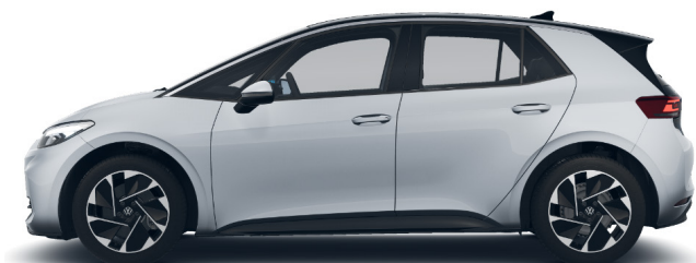
Scale Silver Metallic** 1TA1