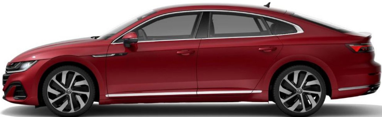
The above image shows optional Kings Red metallic paint

The above specifications are for information purposes only as our products are continually updated and changes may be made to the specifications at any time. If you require any specific feature, you must consult your local dealer who is regularly updated with any change in specification. Specifications are subject to change without notice.