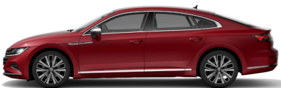
Kings Red Metallic* 1