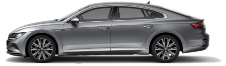
Pyrite Silver Metallic*