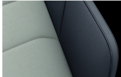
"ArtVelours Microfleece/Vienna" cloth & leather Mistral/Raven (YS) Optional on Elegance models